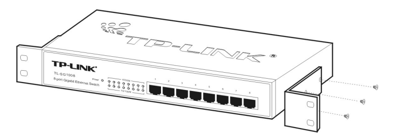
Figure 2-1 Rivet the "L" brackets onto the Switch