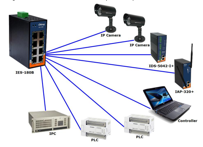
Connections of Ethernet devices

IES-180B can be used in connecting several Ethernet devices like Ethernet I/O, IP-Camera or other Ethernet switches. In addition, its mini size enables easily installation and minimize space requirement.