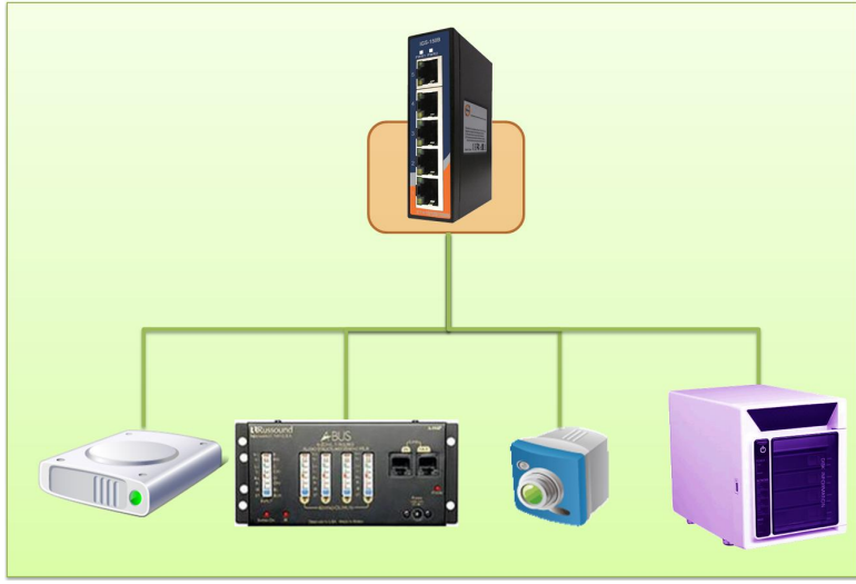
Connections of Ethernet devices

IGS-150B can be used in connecting several Ethernet devices like Ethernet I/O, IP-Camera or other Ethernet switches. In addition, there are two different power inputs at terminal block to avoid interruption caused by power down. When the primary DC power input fails, the backup power input will take over immediately to guarantee a non-stop operation.