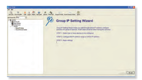
Monitoring and Configuration interface