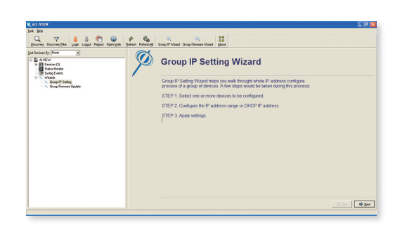
Monitoring and Configuration interface